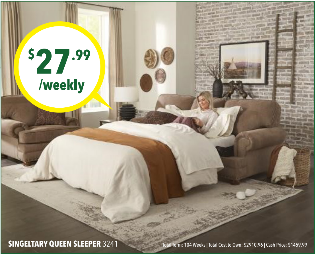
SINGELTARY QUEEN SLEEPER 3241

Total Term: 104 Weeks | Total Cost to Own: $2910.96 | Cash Price: $1459.99