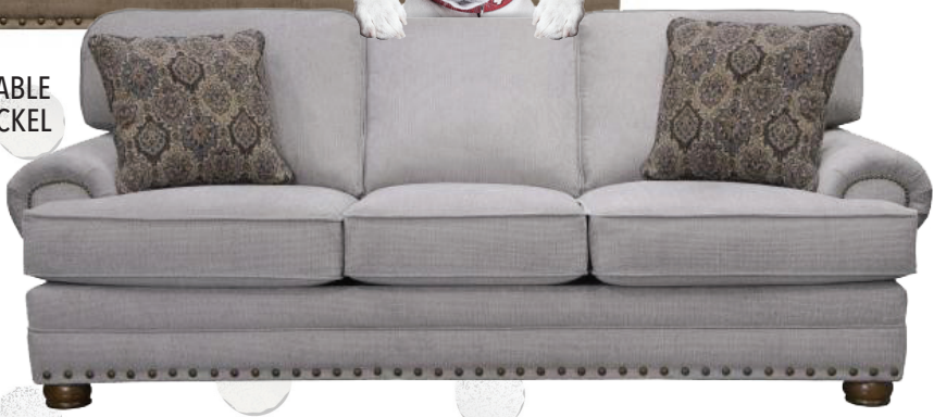
SINGLETARY SOFA 3241

Total Term: 104 Weeks | Total Cost to Own: $2910.96 | Cash Price: $1459.99